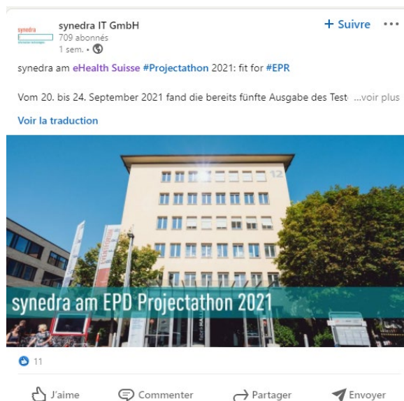
synedra IT tweet