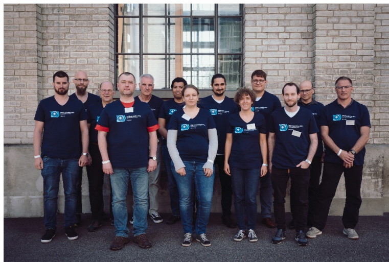
Monitor team of EPR Projectathon 2021