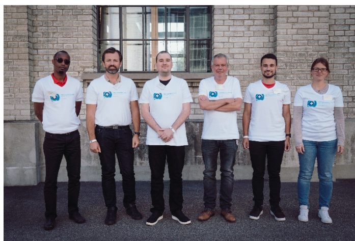
Technical support team of IHE Europe Services & EPR Staff